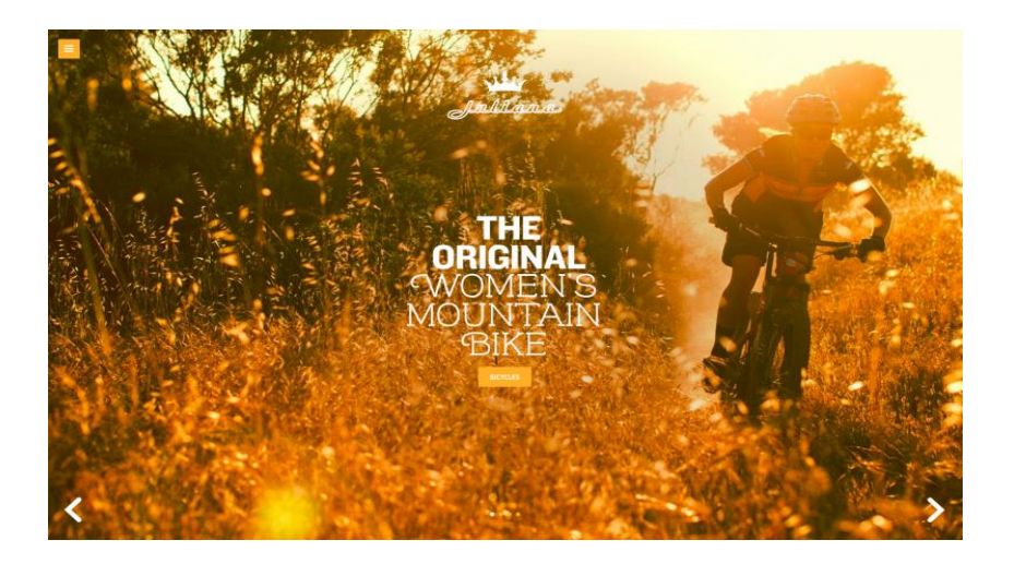
Figure 3: Elements of Impressionism; photographic and light effects; http://www.julianabicycles.com/