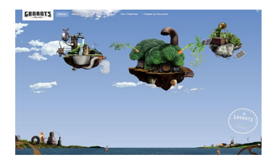
Figure 7: Chromatic symbolism (green, blue); http://www.recycledlifeforms.com/