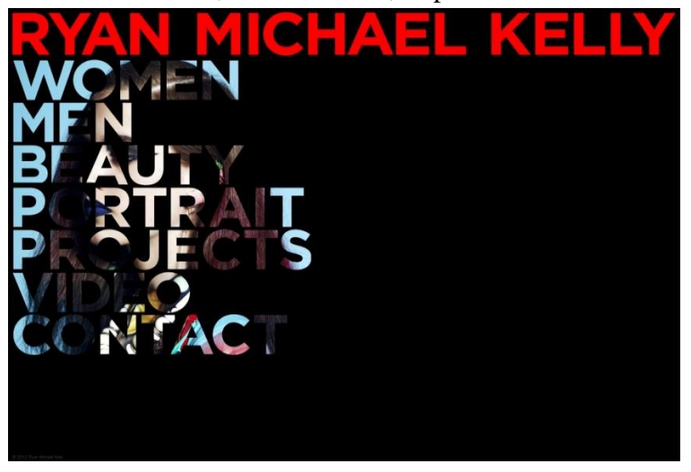
Figure 6: Chromatic contrast on black background; photographic effects; <a href="http://ryanmichaelkelly.com/">http://ryanmichaelkelly.com/</a>