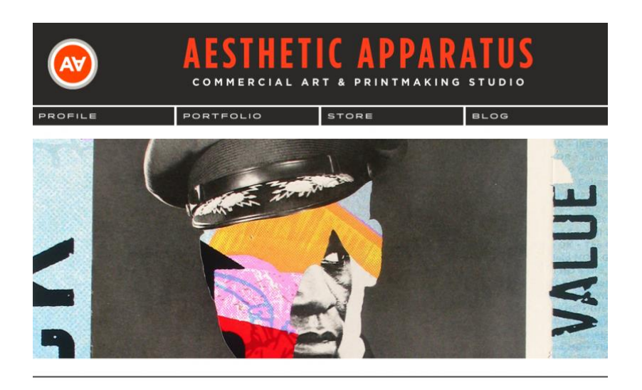
Figure 4: Elements of Pop art and urban-art; <a href="http://aestheticapparatus.com/">http://aestheticapparatus.com/</a>