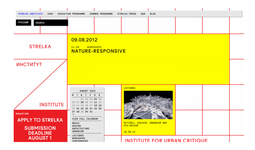
Figure 5: Elements of Surrealism; warm colours; http://www.strelka.com/?lang=en